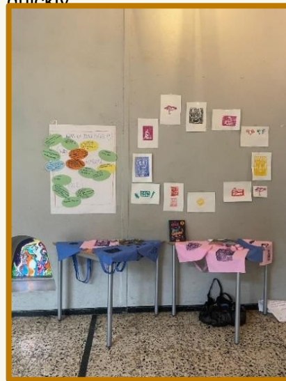
Artistic conclusion to the project week