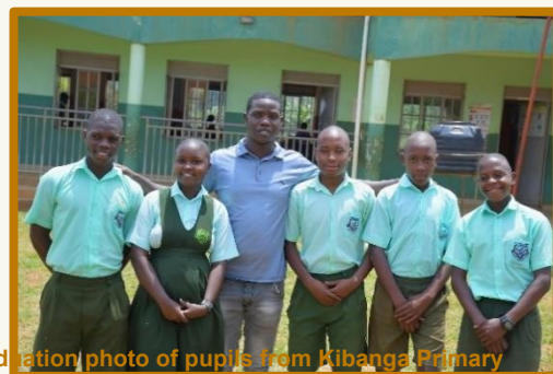
Graduation photo of pupils from Kibanga Primary School